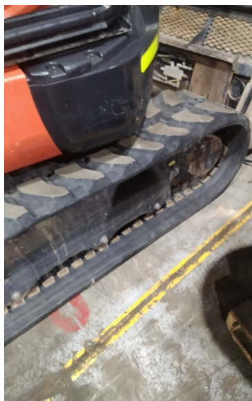
Tyre Condition 4