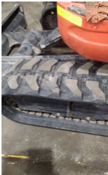
Tyre Condition 1