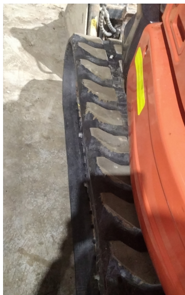
Tyre Condition 4